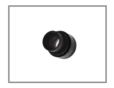
Measuring Eyepiece (Available for $260/$260$/$280/$280$/$350/$350$/$360$/$360$/$390H/$390L)

Equipped with a reticle inside, the eyepiece has a measuring function which can facilitate doctors to measure the pathologies conveniently and give more accurate diagnosis.