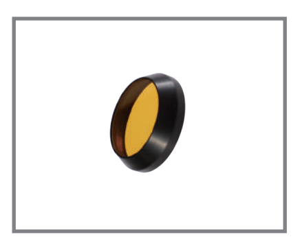
Yellow Filter Module (Available for $260/$260$/$280/$280$/$350/ $350$/$360/$360$/$390H/$390L)

Doctors can observe images at higher contrast with MediWorks yellow filter. The eye tissues look sharper under yellow filter. Images can be switched between with filter and without filter by moving the module. The filter can be mounted in front of objective lens and took off easily from slit lamps.